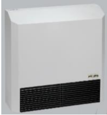
Figure 1: Williams 1753012 Condensing, Direct Vent Wall Furnace