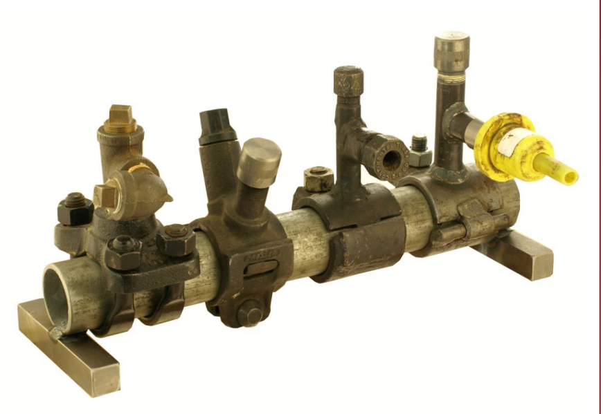
SADDLE TEES ON STEEL PIPE