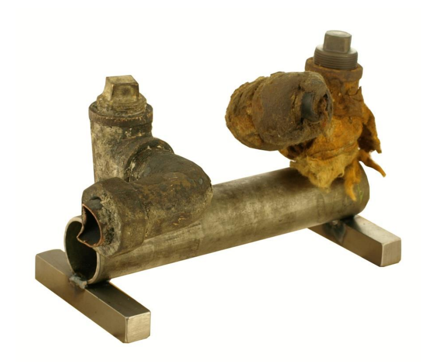
LOW PRESSURE TEES