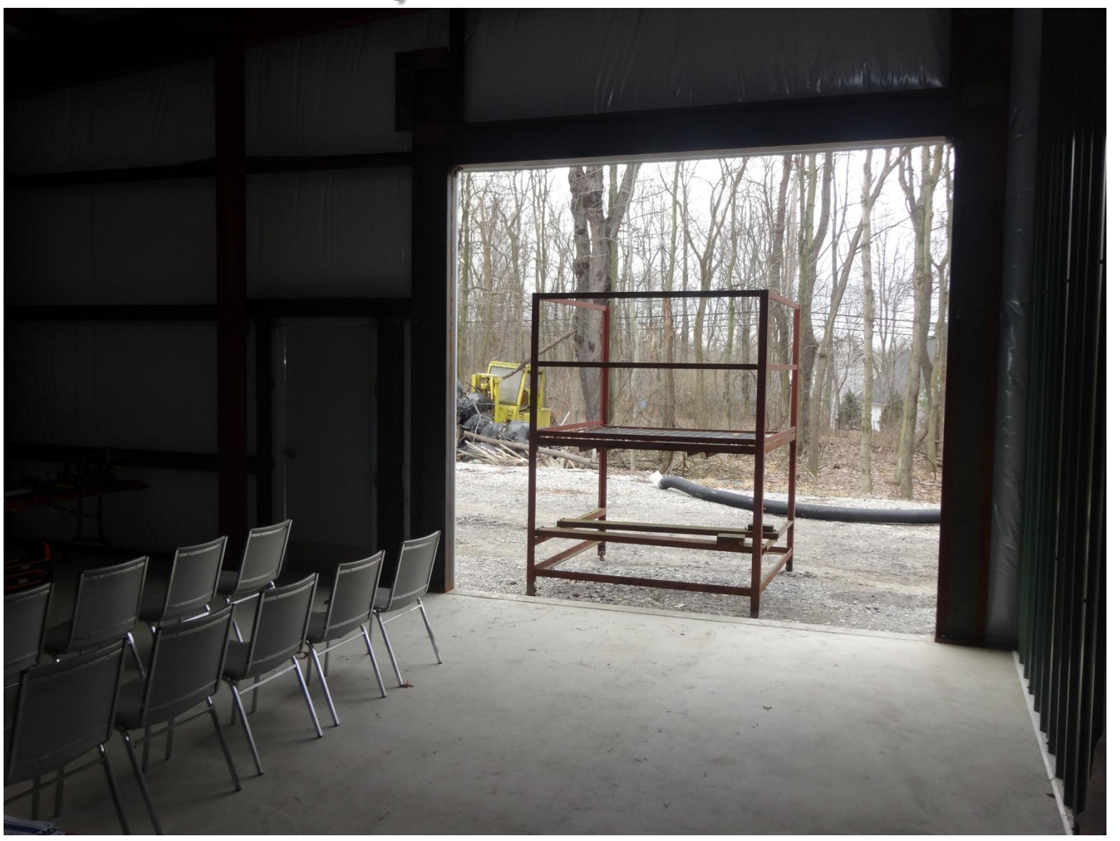
Kravitch Machine Company – 2019 ©