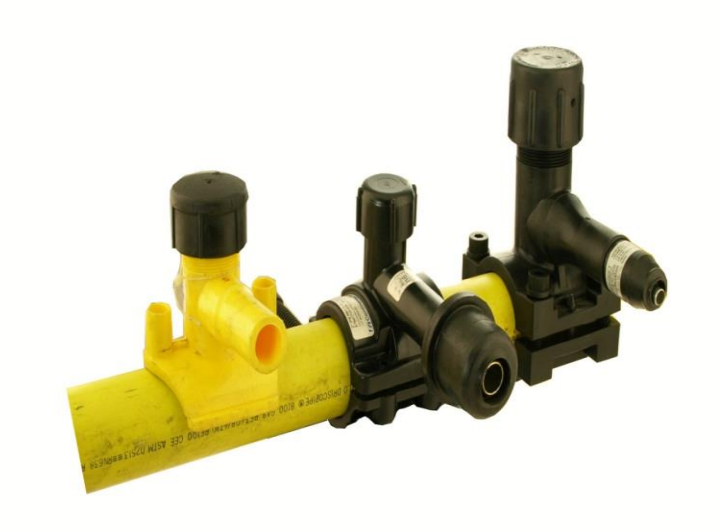
PLASTIC FUSION AND SADDLE TEES