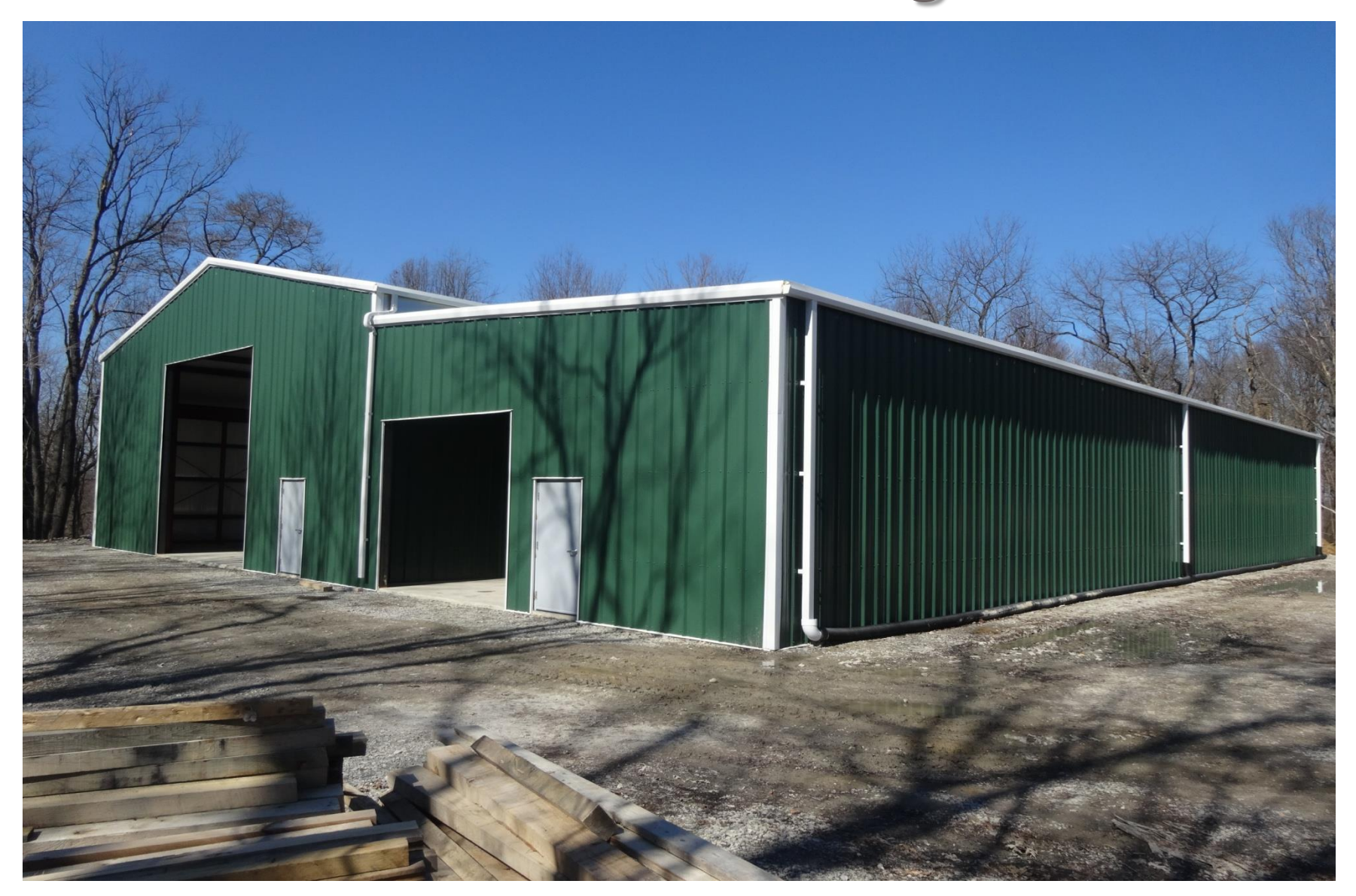
Kravitch Machine Company – 2019 ©