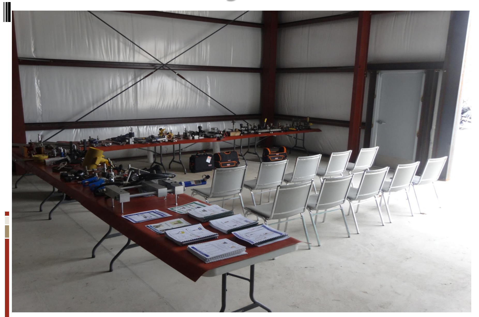
Kravitch Machine Company – 2019 ©