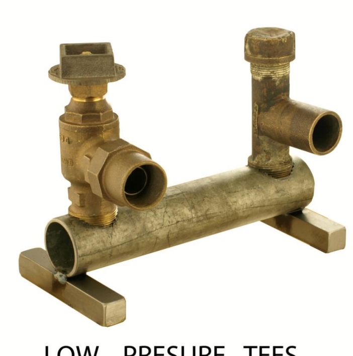
PRESURE TEES LOW