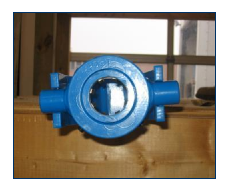
Die with Guide